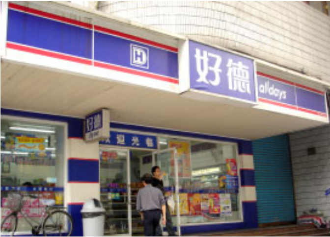
《Chronos 手表》在好德超市各连锁店均有售。 《Chronos 手表》is also available in All Days chain superstores.