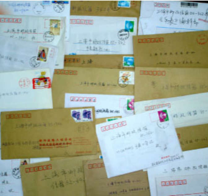
蜂拥而来的读者来信。 Readers' letters from all over China.