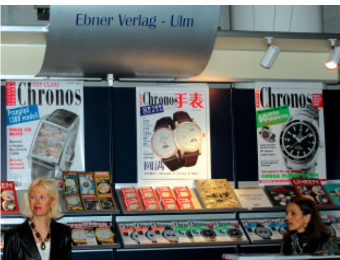
《Chronos 手表》在巴塞尔钟表展 Ebner Verlag 展台。

The third issue will be on the market in June.