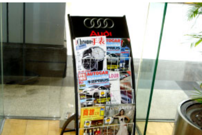
《Chronos 手表》是奥迪媒体中心的合作伙伴。 《Chronos 手表》is exclusive media partner in Audi Media Centre.